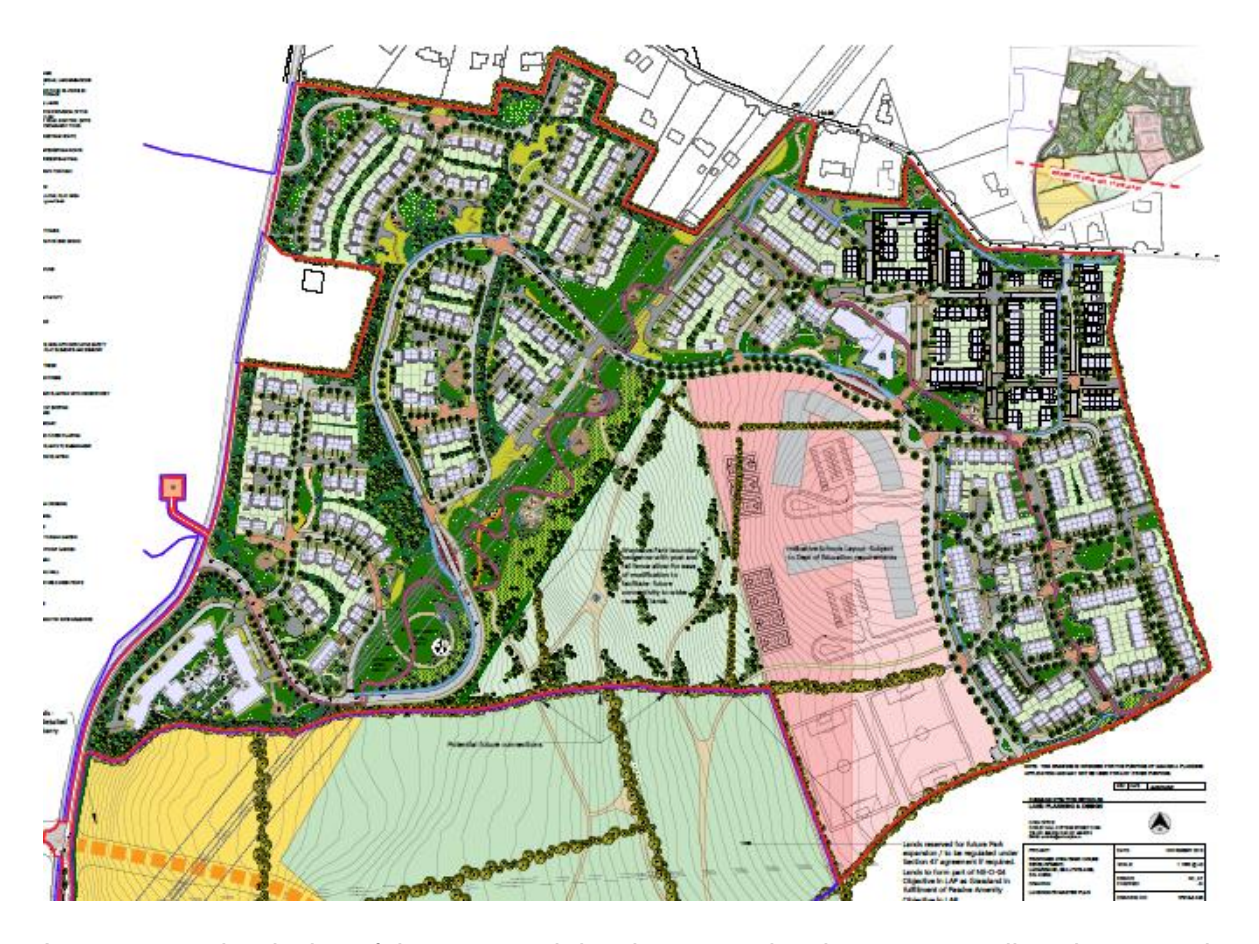
Figure 3.8 Layout proposed in Planning Application (Alternative 4)

In summary, the design of the proposed development takes into account all environmental effects raised with respect to previous design alternatives and within the Board's Opinion, and provides for a development that has been optimised to amplify positive environmental effects whilst reducing negative environmental impacts wherever possible. Table 3.1 summarises the comparison of the main environmental effects.