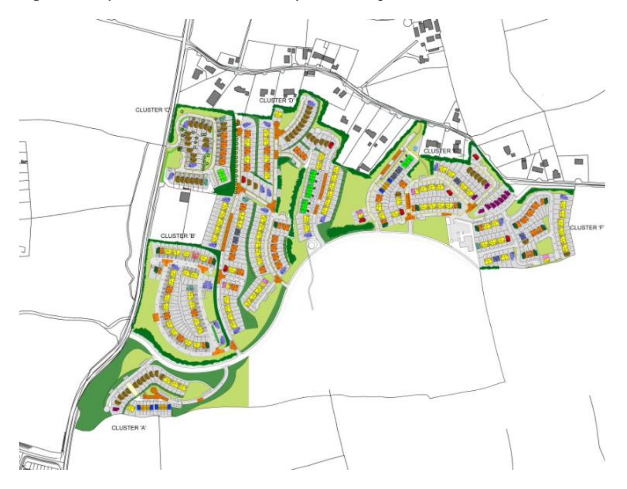
Figure 3.3 Layout submitted to Cork County Council August 2017

At the first Section 247 meeting with Cork County Council in September 2017, all relevant staff members from the various departments of Cork County Council offered feedback on the proposal and those that could not attend the meeting offered feedback via email. The two key items that were discussed at that meeting were the alignment of the distributor road and housing design. The layout at this point allowed for a distributor road with a gradient of less than 8.3%. Cork County Council Housing Delivery Unit and Roads Departments suggested that a gradient in the region of 5% would be more appropriate. Or at least that no long section of road would have a slope exceeding a gradient of 8%. It was also suggested by the Council that the need to connect to the local road to the north of the site may need to be revisited and that there was no need to slavishly follow the road alignment set out in the LAP.